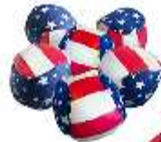
▲ 12 HACKY SACKS