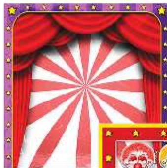
▲ 1 BACK BOARD