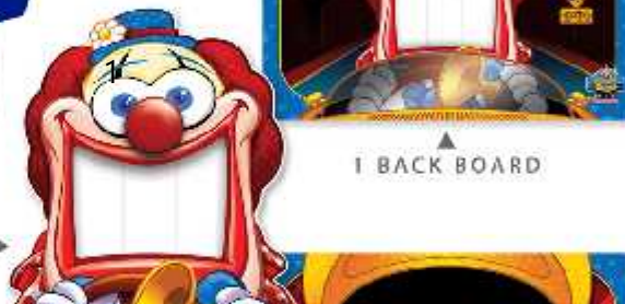
▶ 1 STAND-UP TARGET