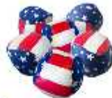
▲ 12 HACKY SACKS